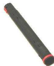
Cod. MGI Extension tube 420mm (2 pcs)