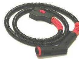
Cod. MGH Steam handgrip 2mt