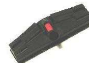
Cod. MGD Floor brush 270mm P.S. remember to use the connector MGB to connect the tool to the steam gun MGF or to the extension MGI.