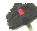
Cod. MGE Triangular floor brush P.S. remember to use the connector MGB to connect the tool to the steam gun MGF or to the extension MGI.