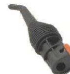
Cod. MGF Steam lance