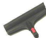
Cod. MGA Window cleaner 230mm P.S. remember to use the connector MGB to connect the tool to the steam gun MGF or to the extension MGI.